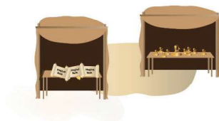
BG7 Everywhere Else (Hall of Tyrannus)