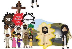
SB9 Paul Healing People in Jesus' Name