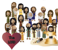
SB18 God's People Are Sent Away from Home