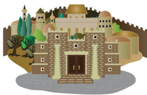
BG4 The Garden Tomb