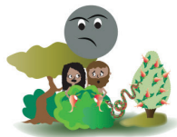
SB8 God Hates Sin