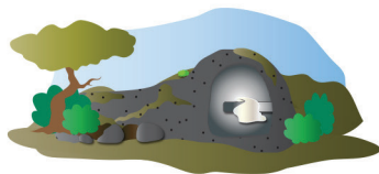
BG5 Stone in Front of Tomb