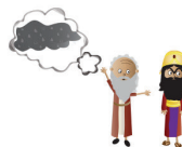
SB13 No Rain for 3 Years