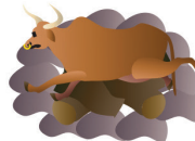
SB22 Men Put Water on Everything