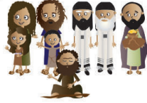
SB4 Sick People Healed