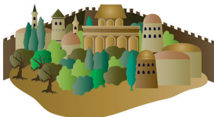
BG4 Jerusalem Occupations