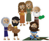
SB10 City Market People and Sick People Listen to Jesus