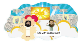
SB29 David Looks Forward to Living Forever with the LORD