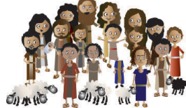
SB7 Pharaoh Welcomes Jacob