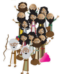
SB19 People of Israel Praise the Lord for Sustaining Them and Rescuing Them