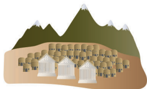
BG3 Worship Place in Philippi